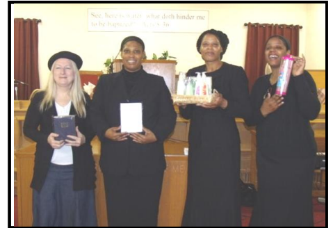
Sisters from Dallas and Lufkin, Texas displaying their gifts at the Sisters' Session during the 46th Church Anniversary Saturday, November 27 th , 2010.