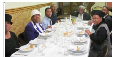
Picture of a few of the saints of Dallas dining together after Sunday service for the December Apostolic Fellowship Dinner.

On December 26 th 2010 we came together for our monthly Apostolic Fellowship Dinner. As noted in the scripture in Acts 2:46 " And they, continuing daily with one accord in the temple, and breaking bread from house to house, did eat their meat with gladness and singleness of heart,... " We thank the Lord for the unity of God's people!