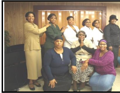
Sisters of Lufkin, Texas posing beautifully for a photograph.