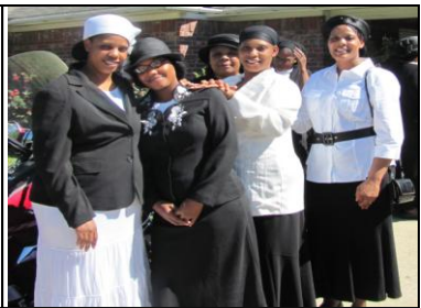
Sisters of Lufkin posing for a photo.