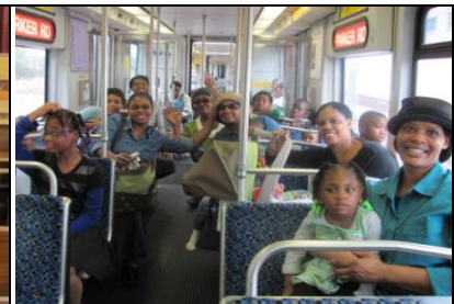
Dallas and Lufkin sisters and children enjoying a train ride in Dallas.