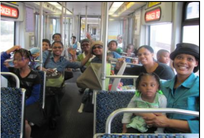
Dallas and Lufkin sisters and children enjoying a train ride in Dallas.