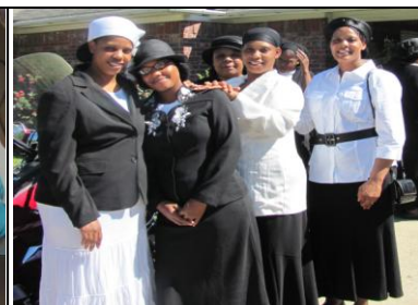
Sisters of Lufkin posing for a photo.